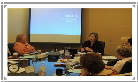
ABOHN BOD Meeting

ABOHN continues to be financially sound. Our CEO and Board budgets and manages the financial goals well. As we broaden our scope to meet the future needs of ABOHN and our credential holders, we believe that opportunities exist to approach businesses for possible grant monies to help supplement our research and development. Many of these corporations are international in scope. Working with partners that enjoy a global workforce intensifies the need for recognized standards across the board, helping us to demonstrate the solid business case for employing a certified occupational health nurse.