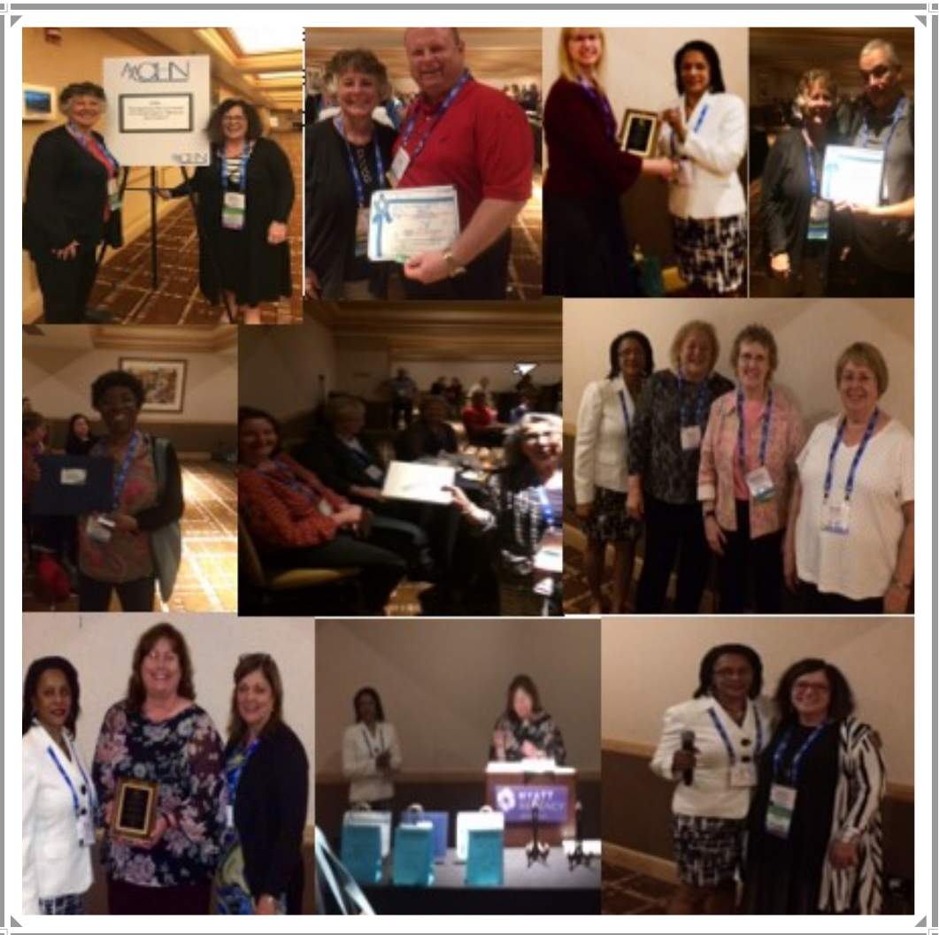
Memories from the ABOHN 2019 Reception!

Thank you to everyone who attended our Reception and Awards ceremony. Your support of ABOHN and your board certification not only keeps ABOHN strong, but helps to shine a spotlight on the unique role of the OHN in every industry that you touch.